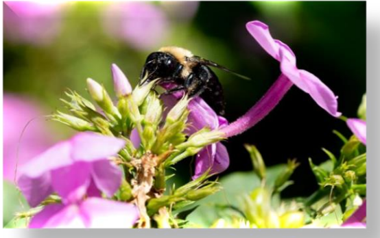
Bee

An article, based on a Master's thesis study, written to raise awareness of the importance of bees and other pollinators for biodiversity and global food security. The results of the study provide some insight into how vineyard management practices that encourage bee presence in the vineyard are not only beneficial for vines and resulting wines, but bee diversity and conservation.