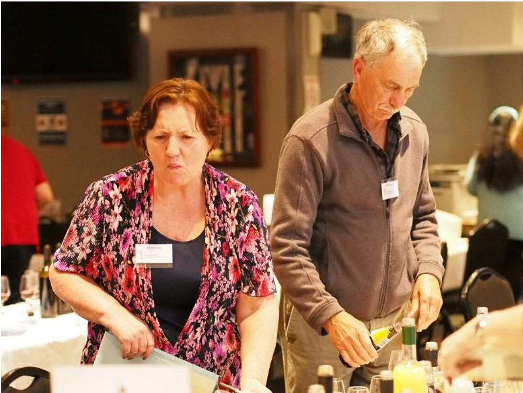
This liquor is just a bit too sour.