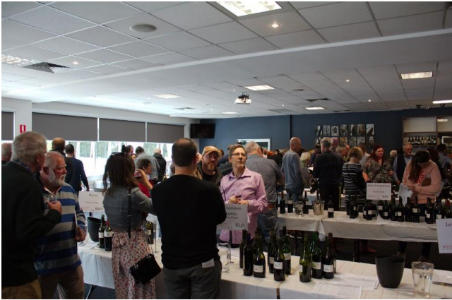
They all realised it was 12 O'clock somewhere