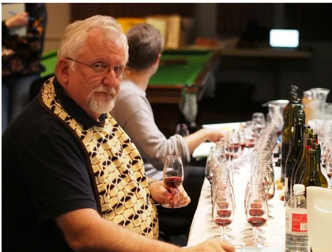
Seriously, I ordered ribs last year at this table and I'm still waiting.