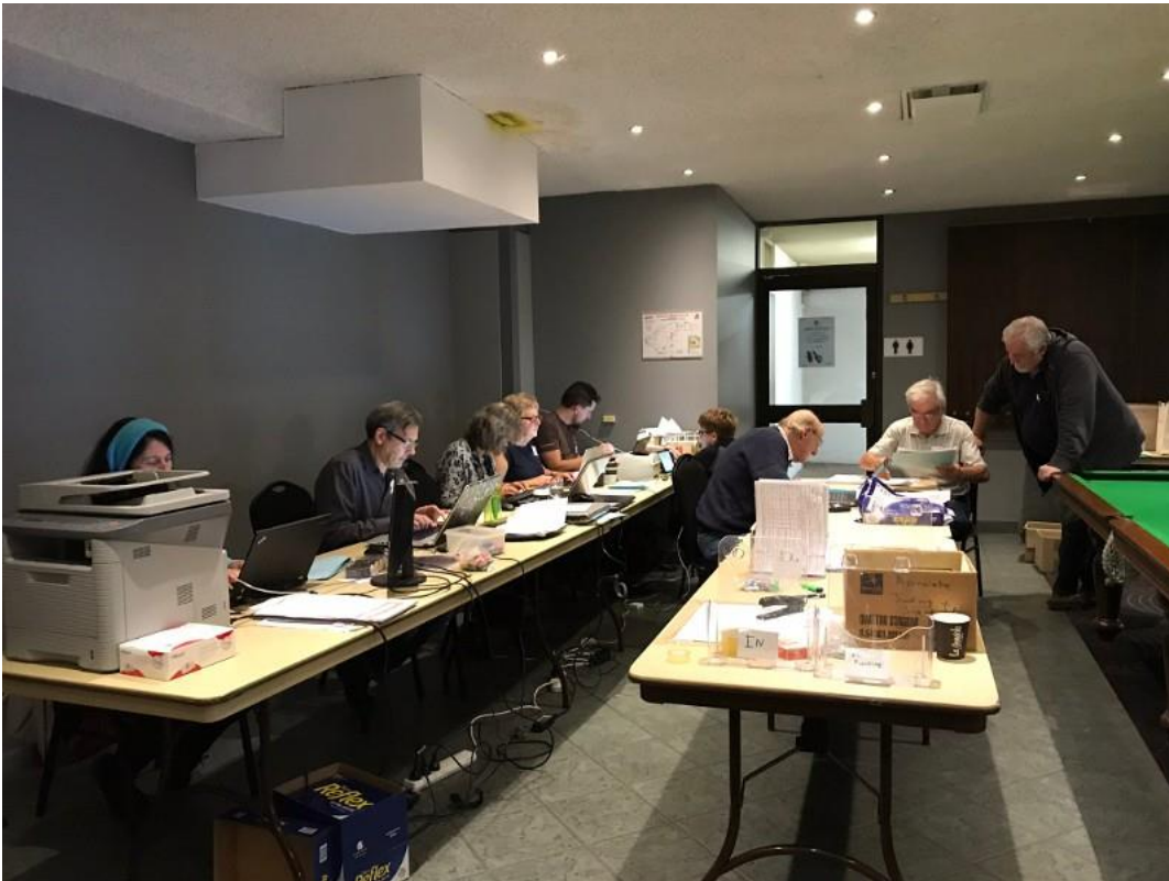
50 years on and they finally cracked the Enigma Code