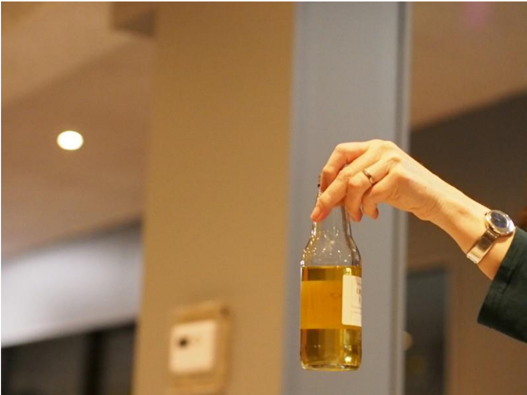
The Committee got permission from The Addams Family and Thing was allowed to judge wines.