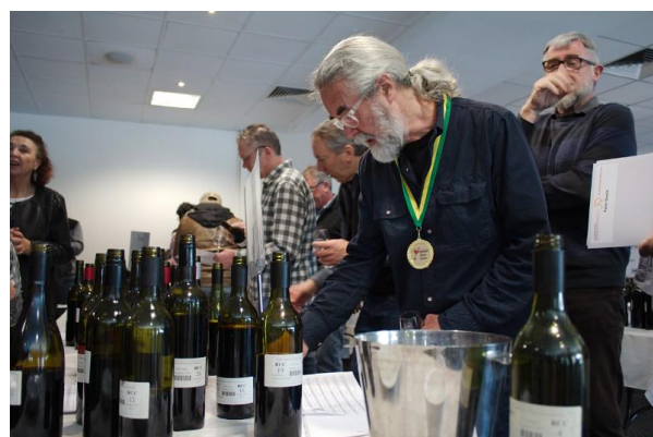
Wonder if I could steel that medal while he's not looking