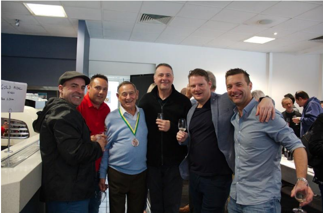
What can we say? This guy did all the work.