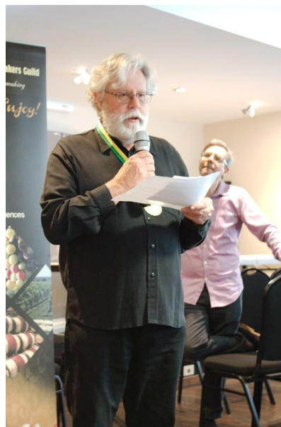
Four Score and seven years ago.