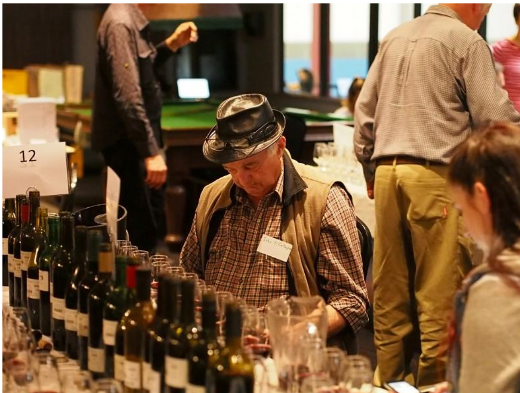
Judging wines can take it out on a man. Another judge micro napping.