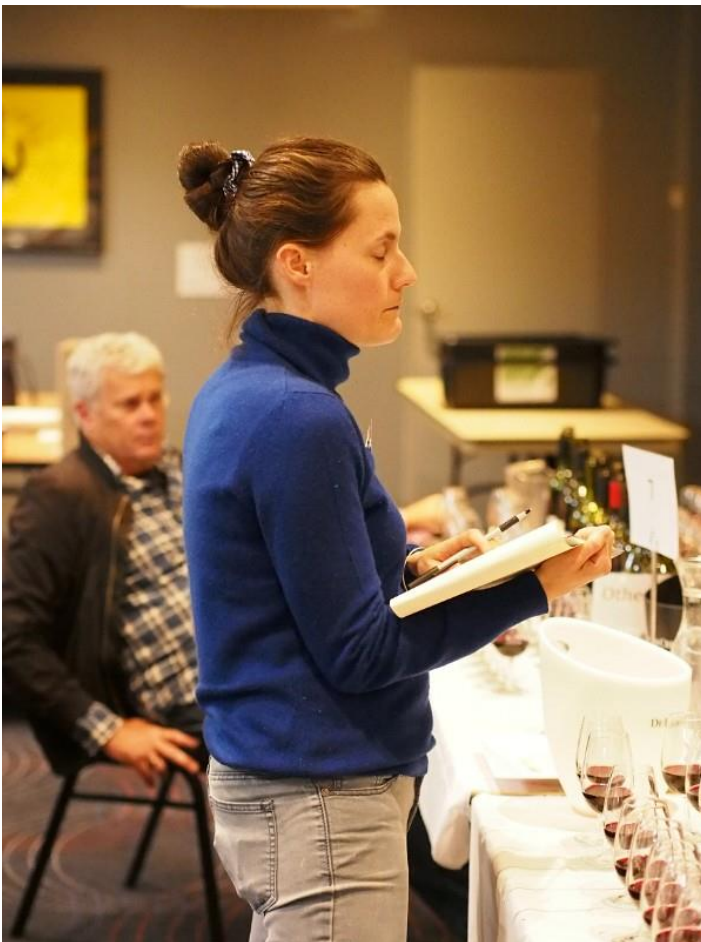
Judging wines is a tiring job and a micro nap is just the remedy to get into the next batch.