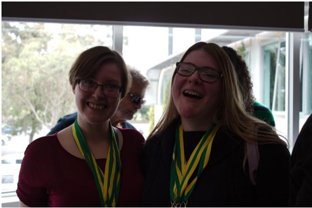
Ha, Ha, Ha. We won all the medals.