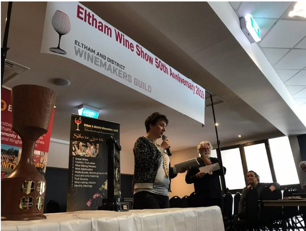
EDWG's 50 Years of Judging wines