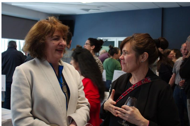
I remember that 82 Lagrein we had 30 years ago.