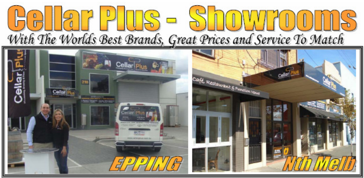
• Importers of all commercial + hobby winemaking, brewing and food Equipment. From grape snips at Harvest, to filters and screew caps come time to fill your bottles.