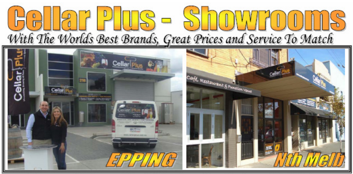
• Importers of all commercial + hobby winemaking, brewing and food Equipment. From grape snips at Harvest, to filters and screew caps come time to fill your bottles.