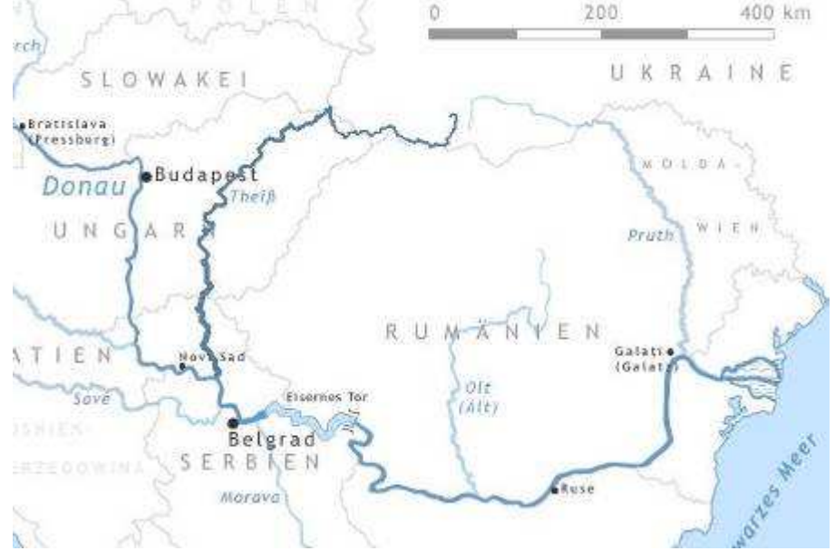
The 'U' shape land between Danube and Thiz River is quite interesting because the river routes remain paralleled when Danube meets Budapest until it reaches Osijek in Croatia.

A map in German (I haven't found a good example in English on the Internet) is quoted below.