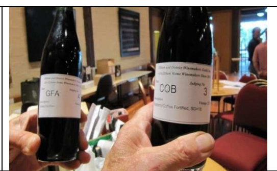
Where do these go?