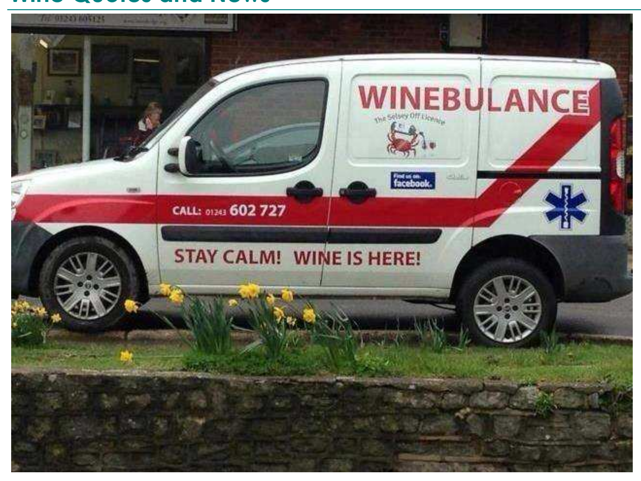
A story from the phoenix team